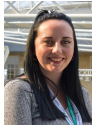
Mercedes Apps Team Leader